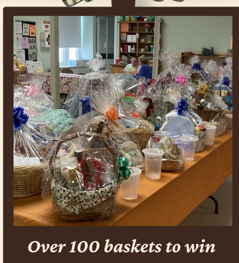
Over 100 baskets to win