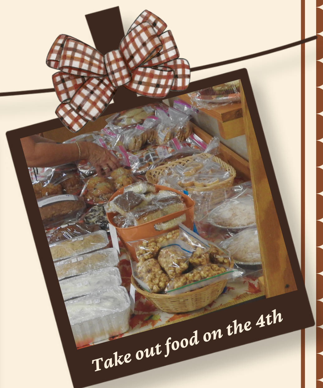
Take out food on the 4th

1028 Church Street, Fogelsville PA 18051