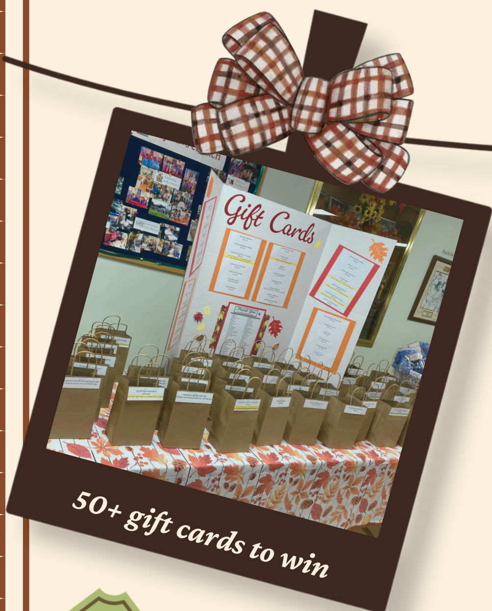
50+ gift cards to win

Tickets may be purchased/placed BOTH days! Ticket pricing: 1 sheet/$10, 2 sheets/$20, 3 sheets/$25 (1 sheet = 25 tickets) Winners will be drawn at the end of the event and contacted by phone.