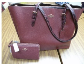
A Coach Bag with matching Coach Wallet

And we have six Specials this year. Specials are items that are more valuable than the regular baskets. Our Specials include: