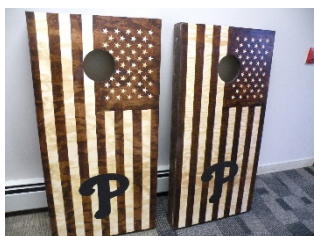
A Cornhole set