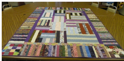
A Hand-Made Quilt measuring 65" x 75"

A Philadelphia Eagles Merchandise basket (coming soon)