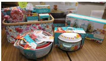
Pioneer Woman Collection of casserole dishes and other cookware items