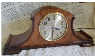
A GE Revere antique mantle clock with Westminster chimes