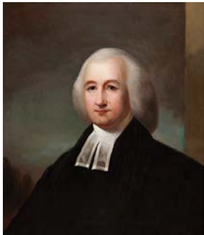
Henry Melchior Muhlenberg

But the story doesn't end with the first immigrations from northern Europe. The nineteenth century brought increased missionary activity to the scene, and in time some of those who had been taught by these missionaries also came to North America, bringing their own Lutheran customs. So now our mix includes heritages such as Ethiopian, Nigerian, Liberian, Korean, Chinese, Indian, Palestinian, Brazilian, and many more. Where can your congregation trace its roots?