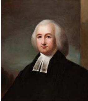
Henry Melchior Muhlenberg

But the story doesn't end with the first immigrations from northern Europe. The nineteenth century brought increased missionary activity to the scene, and in time some of those who had been taught by these missionaries also came to North America, bringing their own Lutheran customs. So now our mix includes heritages such as Ethiopian, Nigerian, Liberian, Korean, Chinese, Indian, Palestinian, Brazilian, and many more. Where can your congregation trace its roots?