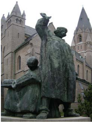
Statue of Olaus and Laurentius Petri

Lutherans from these lands and many others came to America, establishing first separate enclaves, but gradually merging with other Lutherans into church bodies, including our current Evangelical Lutheran Church in