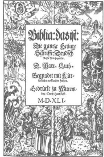
Title page from an early printing of Luther's translation

Luther's work on a German Bible was a landmark achievement. It influenced others in many countries, including England, to do the same. He brought the scriptures into the language of his people, and in so doing spread the gospel.