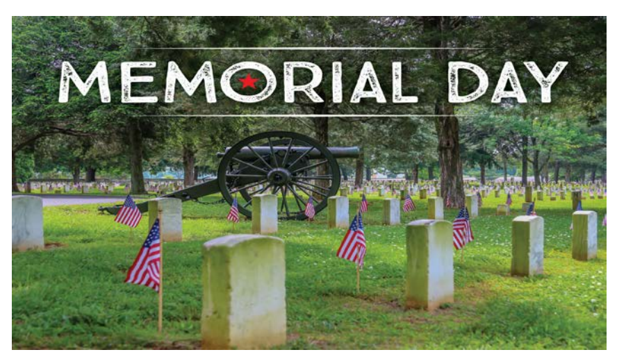
MAY 30, 2016

PLEASE HAVE YOUR ARTICLES SUBMITTED TO THE CHURCH OFFICE BY THIS DATE.